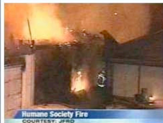
Humane Society Fire COURTESY: JFRD

Jacksonville Fire-Rescue Image One building of the Jacksonville Humane Society was totally engulfed in flames when firefighters arrived about 2 a.m. Saturday.